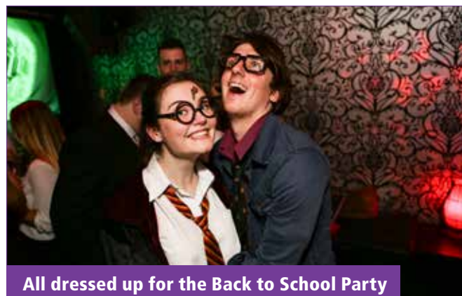
All dressed up for the Back to School Party

Working with NAS as our core partner we were able to navigate and pull off a sold out event that we hope students will be talking about for years to come. A video of the event, produced by RMITV, can be found at: www.youtube.com/watch?v=3S_GHILvf2w