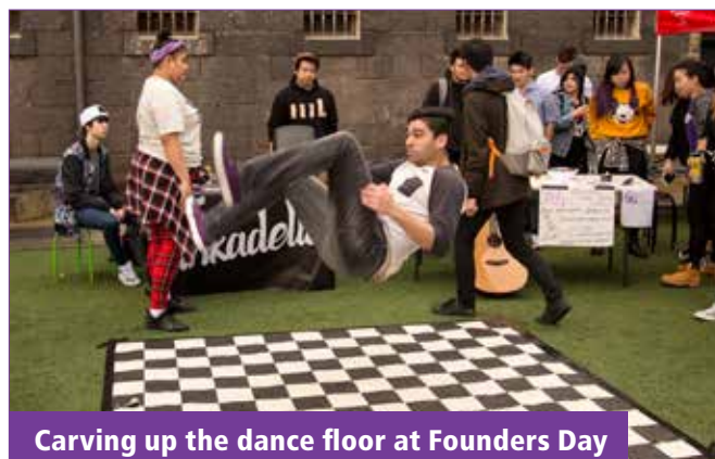
Carving up the dance floor at Founders Day