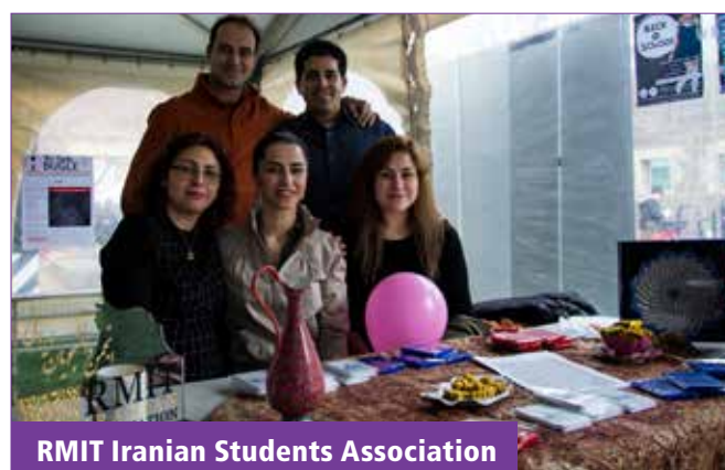
RMIT Iranian Students Association