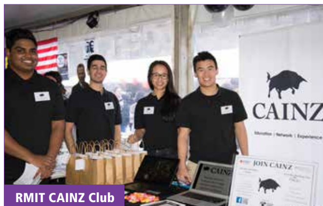
RMIT CAINZ Club