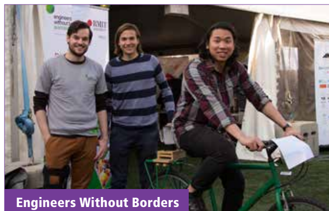
Engineers Without Borders

Over 80 RUSU club executives registered for the first semester of the RASCAL Club Leadership Program. Fourteen training sessions were delivered by RUSU including certificated training in Food Safety Handling and Responsible Service of Alcohol. Other RUSU-provided training included Leadership Communications, Networking Strategies for Student leaders, Community First Aid, General Executive Training, Running Club Meetings training and Clubs Financial Management training. RASCALS also attended generic RMIT LEAD training sessions: Ethics in Leadership, How Volunteering Links to your Future Career, LEAD and LinkedIn, Leadership and Assertiveness and Professional Communication Skills for the Workplace and First Impressions. RUSU looks forward to RASCAL continuing in 2016 and providing more RUSU club leaders with this support and recognition.