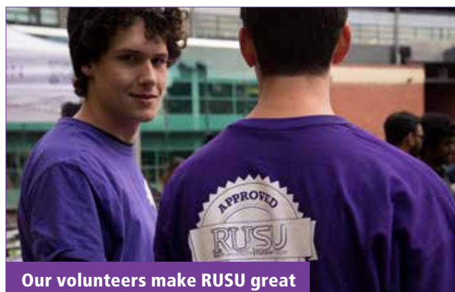
Our volunteers make RUSU great