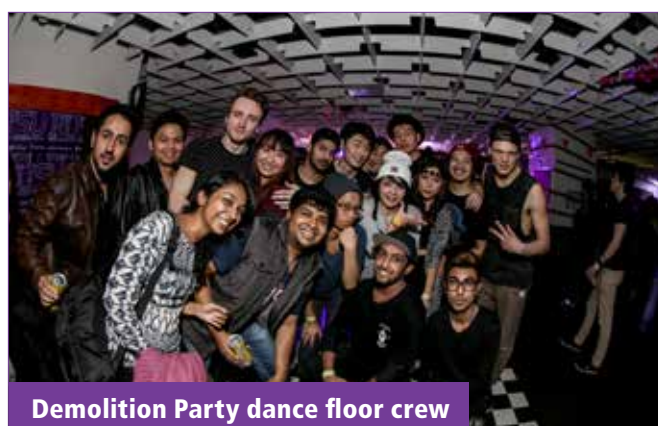
Demolition Party dance floor crew