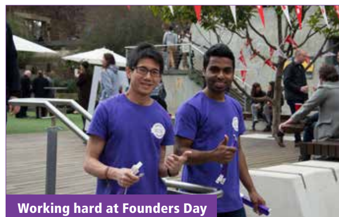
Working hard at Founders Day