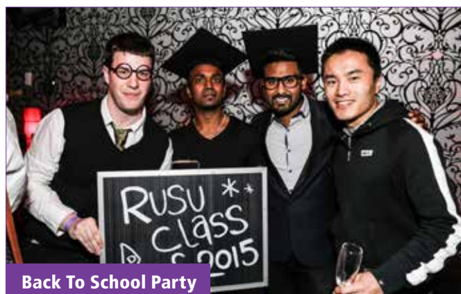
Back To School Party