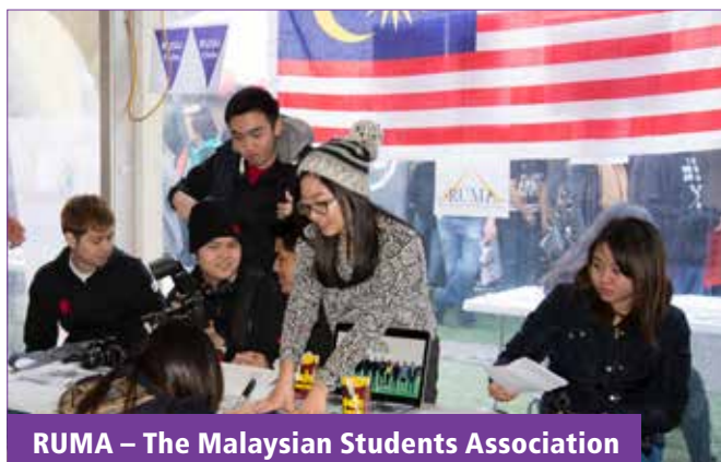
RUMA – The Malaysian Students Association