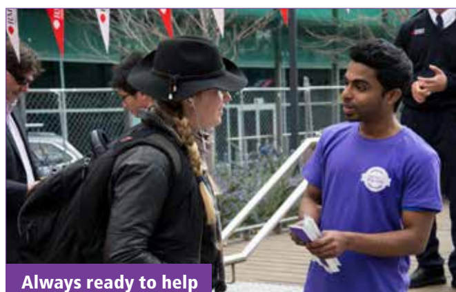
Always ready to help