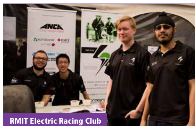
RMIT Electric Racing Club

RUSU is pleased to welcome these new groups which reflect the increasing cultural diversity of the student body and the University itself.