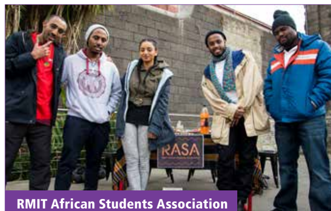
RMIT African Students Association