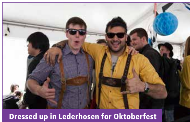
Dressed up in Lederhosen for Oktoberfest

Over the third quarter we had 588 new members sign up and pay, bringing the annual total to more than 5200 members. This is a great result, with memberships up 46% compared to this time last year!