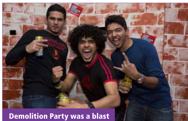
Demolition Party was a blast