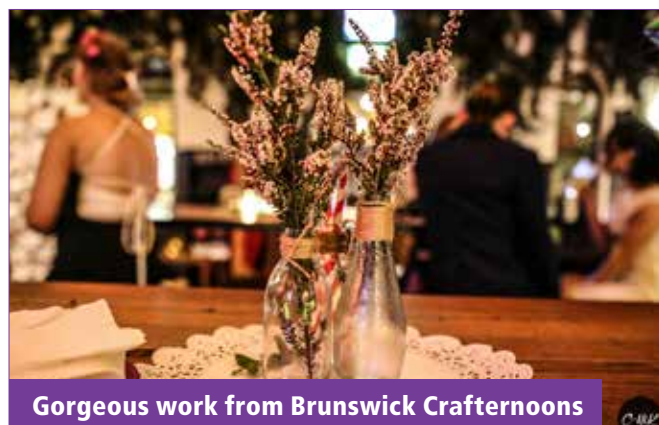
Gorgeous work from Brunswick Crafternoons