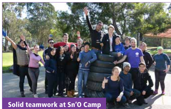
Solid teamwork at Sn'O Camp