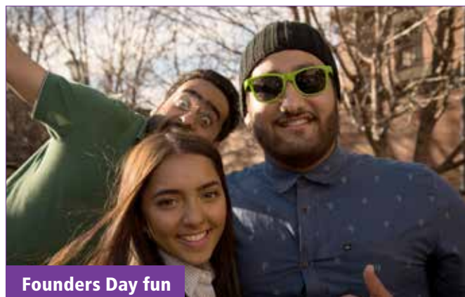
Founders Day fun

The highlight of the event was seeing such a diverse group of students – local, international, exchange, undergraduate, postgraduate and from every RMIT campus – get on so well, pitching in to set up for dinner and helping each other navigate the high ropes course. We have been so excited to see these same students at subsequent RUSU events, with many also joining our volunteer program and some taking up the challenge of leadership roles within RUSU Clubs and Societies.